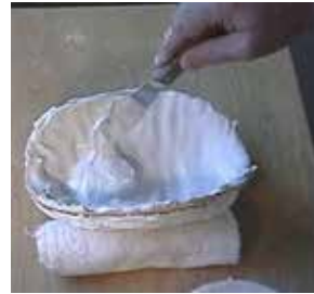
Mix the second bag of LiquiStone the same as the first bag. Put a big blob of LiquiStone in the middle top of the casting.