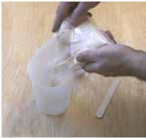
Put the orange alginate powder into the plastic mixing container.