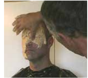
Use your thumb or fingertips to push the alginate into the corners of the eyes.