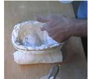
Once its a little wet, you can smooth out the edge with your fingertips.

Wait at least 1 hour after the second coat of stone before unmolding your face cast.