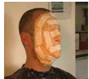
Another view of the placement of the plaster bandage strips.