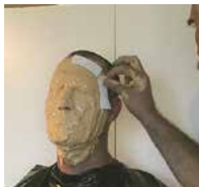
Just before the alginate sets, quickly apply the small strips of DRY plaster bandages all around the perimeter.