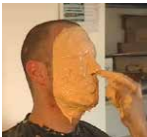
You can use the included popsicle stick to paint on the alginate around the nose.