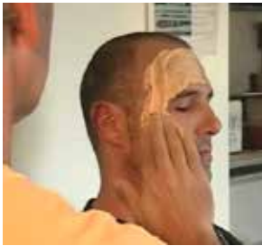
Begin applying the alginate. If the hair is long, comb it or pull it back. Alginate won't stick to hair but will make removal more difficult.