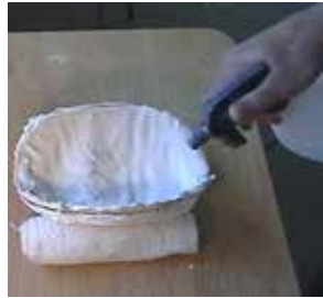
Wait at least 1/2 hour for the first coat to set. Spray the set LiquiStone with water.

Important Note: Clean the LiquiStone out of your plastic mixing container with a wet paper towel. Do not put LiquiStone down your sink or you risk permanently clogging it up.