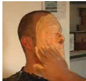
Add more alginate all over. Your goal is to put approximately 3/8 to 1/4 inch all over.