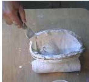
Make the edges at least 3/4 inch thick all the way around.