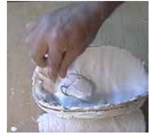
Push the wire loop into the blob with the round part facing up and well clear of the LiquiStone.