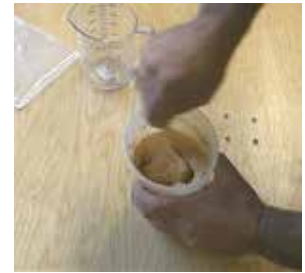
Stir, then mix the alginate for 45-60 seconds. Don't go slowly- the clock is ticking.