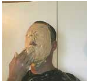
The corners of the mouth tend to trap air bubbles. Push alginate against the lips from side to side.