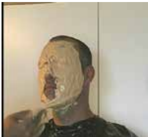
Cover down to where the chin meets the neck.