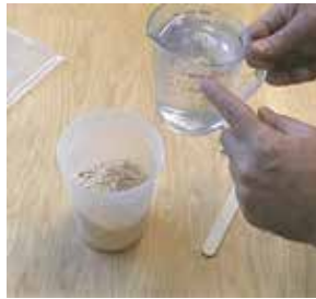
Measure out 14 fl.oz. (1 cup, 6 oz.) water.