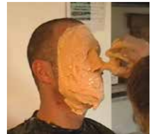
Lastly, carefully apply alginate to the edges of the nostrils and the tip of the nose.