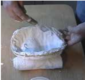
Add LiquiStone around the edges of the casting to reinforce them.