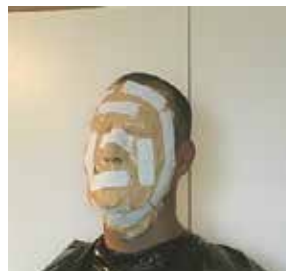
Apply more strips over the mouth, on the nose, forehead, cheeks, etc.