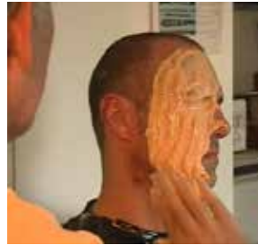
At first your goal is to put a thin layer all over the face.