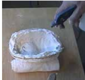
Spray this coat of LiquiStone again.