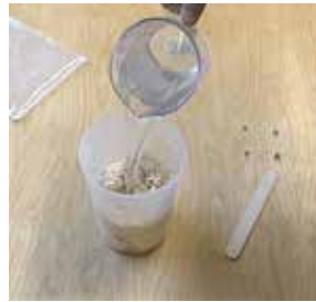
Add the water to the powder.