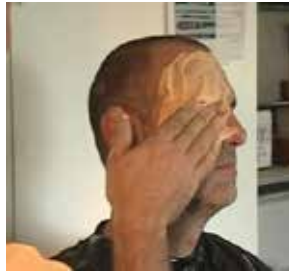
Pay attention to the high bubble areas- corners of the eyes, mouth and around the nose.